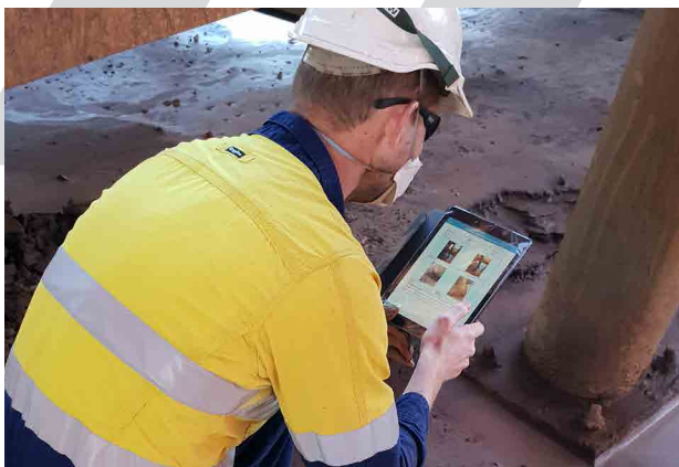
Asset management tool in action

Fast, consistent and reliable assessment of asset condition in the field. The data is uploaded to the dashboard in real time.